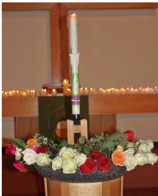
Roses in the baptismal font.

On July 28th SCoR members let roses and candles bear witness of their compassion with the people of Norway following the tragic events on 22 July when a deranged citizen blew up a car bomb in Oslo and shot dead young people at a Labour Party youth camp