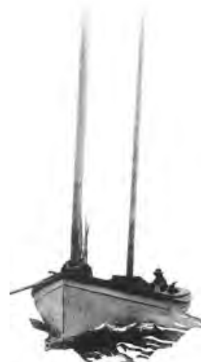
Icelandic fishing boat on Lake Winnipeg