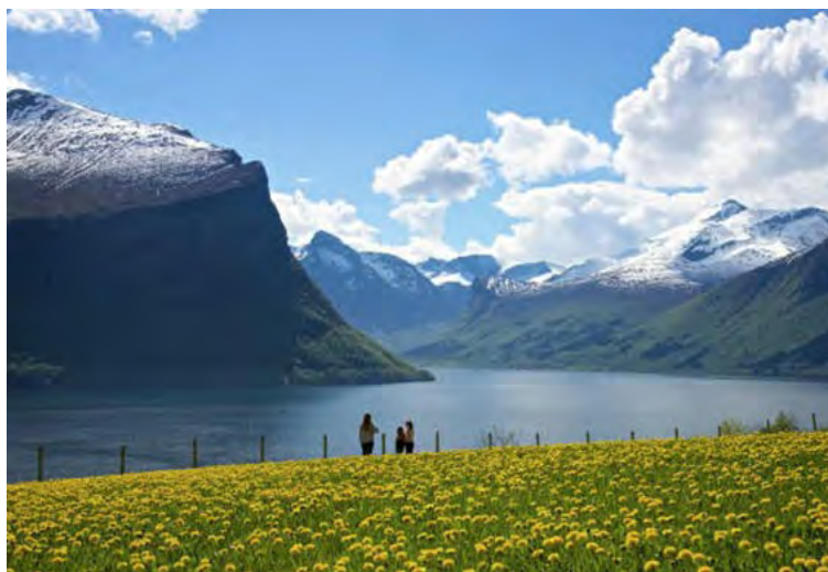
Klungnes by the Romsdalsfjord in Møre og Romsdal, Norway.

The Norwegian landscape is very closely connected to the country's cultural background. Outdoor activities make up a large part of the northern lifestyle because of the amazing natural occurrences observable year-round and the adventurous spirit of the Norwegian people. Thanks to the fact that Norway is the least populated country in Europe, its inhabitants and visitors alike are able to enjoy and appreciate their natural surroundings with very little human interference.